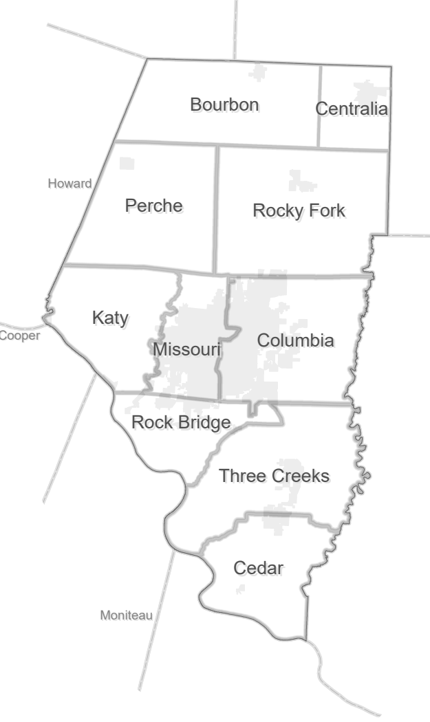
Boone County, MO Civil Townships